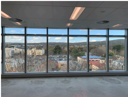
Panoramic views to the north-east