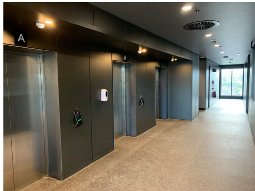
Public lift access from basement and ground