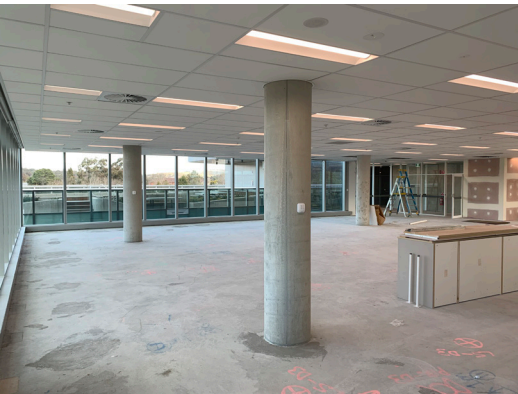
Large open plan office space