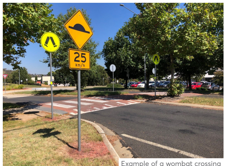
Example of a wombat crossing

Construction will occur Monday to Friday, between the hours of 7am and 6pm.