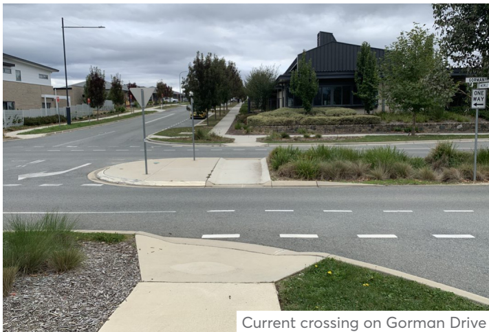
Current crossing on Gorman Drive

The works will include installing a 'wombat' crossing, widening and raising the centre median and installing 25km/h speed hump signs on both sides of the crossing.