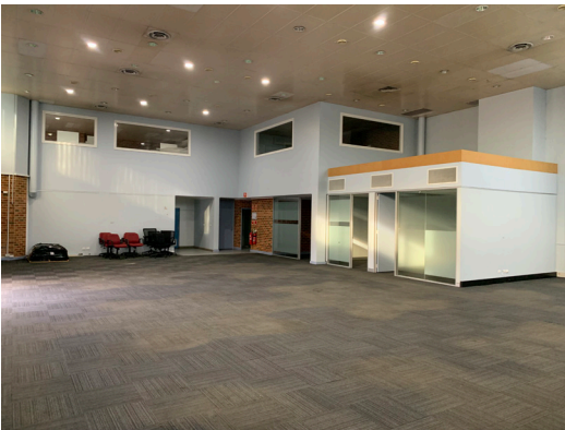
Large open plan areas plus offices