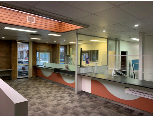
Front-of-house service counter