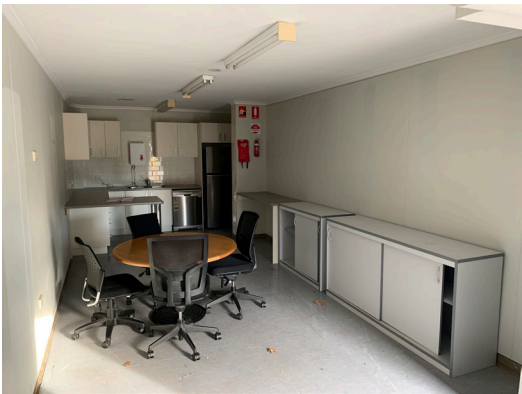
Multiple staff amenities