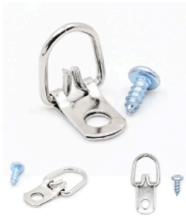
Medium 1-Hole Hanger