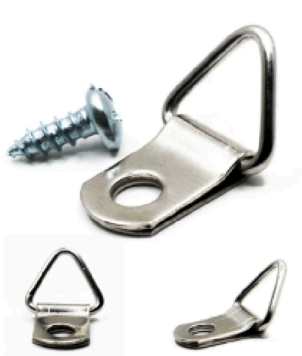
Small 1-Hole Hanger